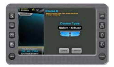
Touch the arrows to select a course that is not mapped. Touch [Map Course].

NOTE: Additional Details on Course List: The blue lettering above the course list displays the mapped information for the course selected. Always highlight a course on the list page before mapping a new course. When mapping a course, the program assigns the mapping to whatever name is highlights on the course list. For example, if Course1 was previously mapped and is highlighted when a new course is mapped, the new mapping will overwrite the original.