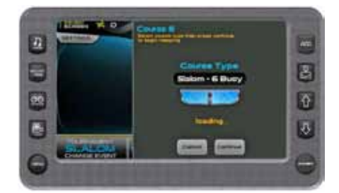
Allow the program time to load.

Touch the arrows to select a course type: Jump, Slalom 4-Buoy or Slalom 8-Buoy. Touch [Continue.]