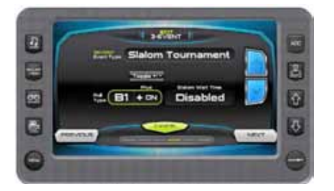
Touch the Toggle +/- to set ON or OFF.