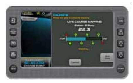
Press the [End Gate] to complete Mapping.

If necessary, touch [Cancel] to cancel the current mapping and return to the course list.