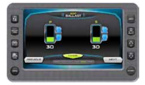
Set the ballast tanks by touching and sliding the finger up the tank area or by touching the [UP] and [DOWN] arrows alongside the tank area. Touch [NEXT] to continue.