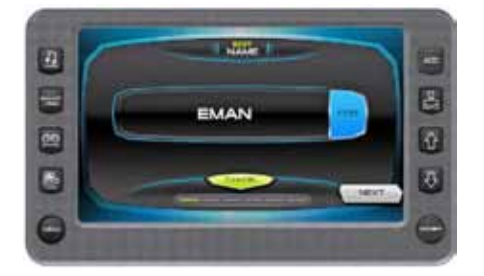
Touch [NEXT] to continue.

Type a name for the new profile using the touch keypad and touch [DONE].