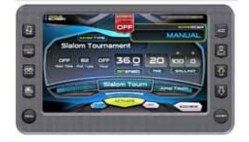
Touch [ADD NEW] to create a new profile.

A new rider profile can be setup using the touch screen. To create a new profile, press the [ Profile ] Quick Access Key: