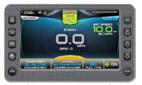
On the 3 Event Screen, everything is activated.