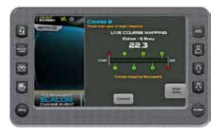
Course Mapping Successful will appear on the screen.