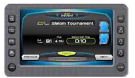
Touch to highlight the Wait Time; touch the arrows to change the setting.