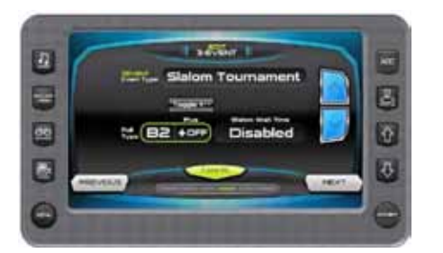
Touch to highlight the Pull Type; touch the arrows to change the setting.