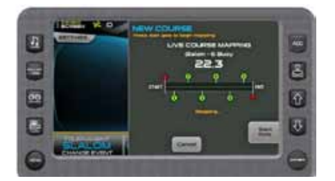
Press the [Start Gate] to begin Mapping. NOTE: For Slalom, press the [Start Gate] button when the GPS puck crosses the start gate.

For Jump, press the [Start Gate] button when the ski pylon crosses the start gate.